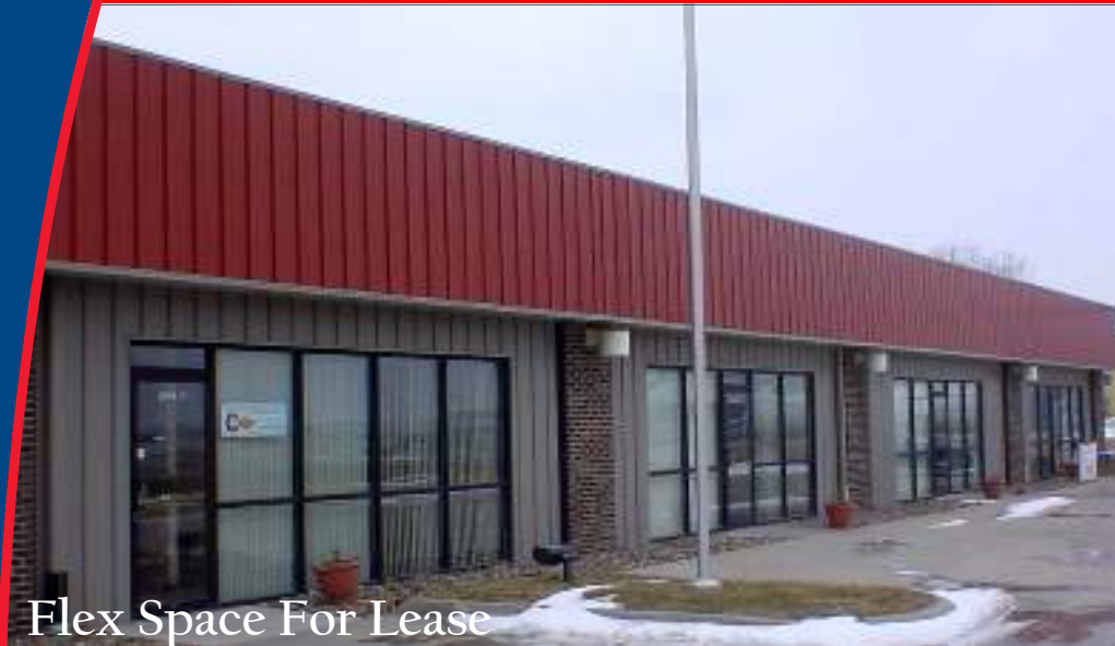
Flex Space For Lease